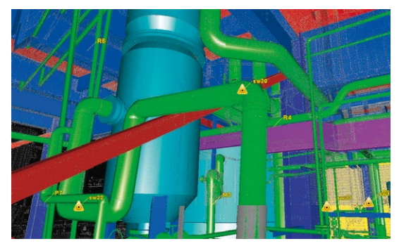
The automated Pipe Run feature lets users select points on connected, straight pipe sections, and the system automatically models a best fit pipe run with elbows in seconds