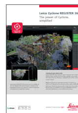
Leica Cyclone REGISTER 360

Microsoft, Windows® and the Windows logo are either registered trademarks or trademarks of Microsoft Corporation in the United States and / or other countries.