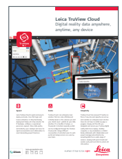
Leica TruView Cloud

Leica Geosystems AG Heinrich-Wild-Strasse 9435 Heerbrugg, Switzerland +41 71 727 31 31